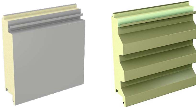
Figure 2: Examples of Formawall Dimension Series non-profiled (left) and profiled DS60 (right) IMP products

According to ISO 14025, EN 15804 and ISO 21930:2017